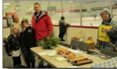
First Annual Bayview Village On Ice: BVA December Skating Party