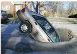
Pothole and car meet up in Michigan.

If you can't join us for the walk remember to celebrate Earth Hour. Be creative. Plan a candlelight dinner for your sweetie or some friends. Play board games, tell stories, hold a candlelit story time, sing songs with your kids. Go for a walk!