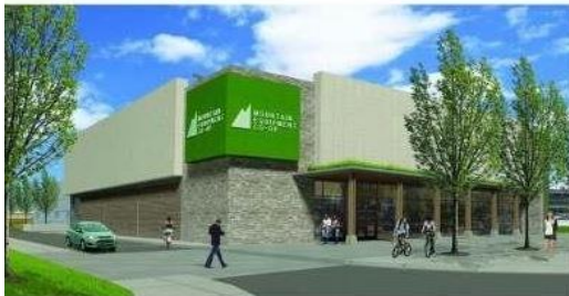
MEC: 784 Sheppard E, Artist's drawing